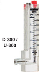
D-300 / U-300